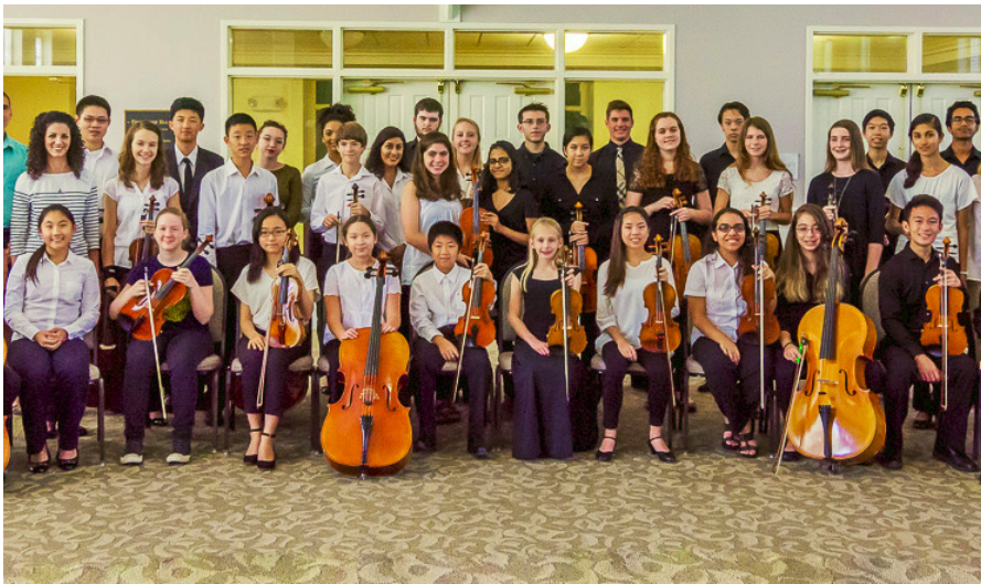
Members of the North Carolina Chamber Music Institute