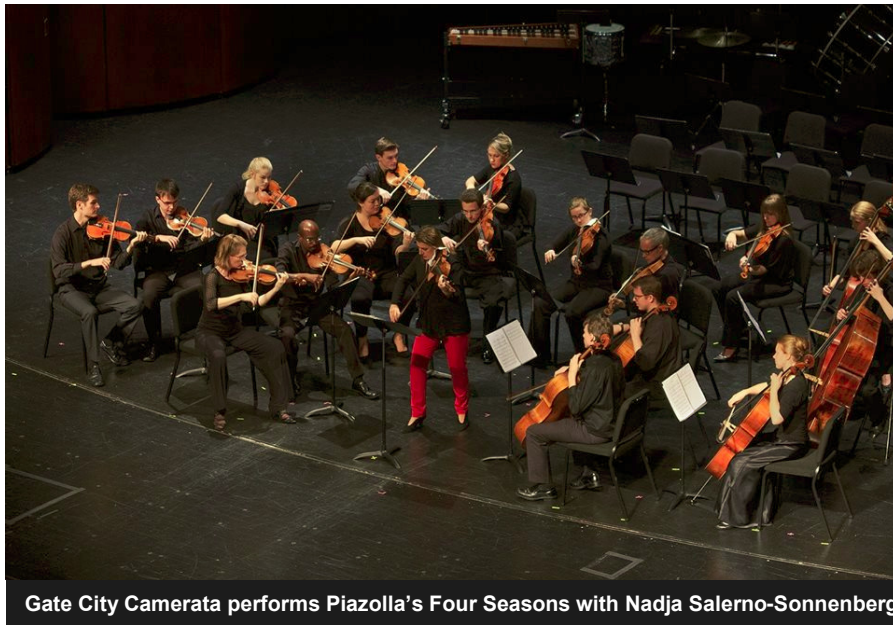
Gate City Camerata performs Piazzolla's Four Seasons with Nadja Salerno-Sonnenberg